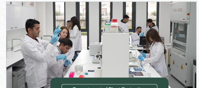
Department of Plant Protection